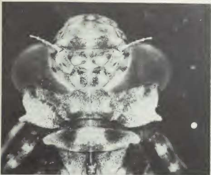
Fig. 1. Dendroaeschna conspersa , dorsal view of the head